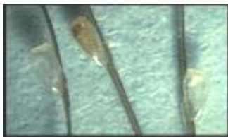
Figure 2: Nits (lice eggs)