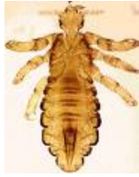
Figure 1: Head Louse Pediculus capitis

Head lice are small, wingless parasitic insects. They are typically 1/6 -1/8 inches long, brownish in color with darker margins. The claws on the end of each of their legs are well adapted to grasping a hair strand.